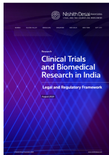
August 2024 Clinical Trials and Biomedical Research in India Legal and Regulatory Framework