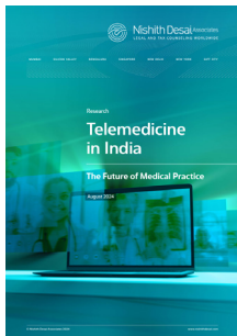
August 2024 Telemedicine in India The Future of Medical Practice