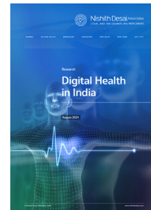
August 2024 Digital Health in India