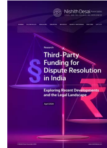
April 2024 Third-Party Funding for Dispute Resolution in India Exploring Recent Developments and the Legal Landscape