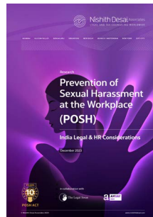
December 2023 Prevention of Sexual Harassment at the Workplace (POSH) India Legal & HR Considerations