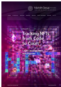
February 2024 Tracking NFTs from Code to Court Legal Considerations and Disputes