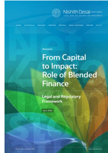
June 2024 From Capital to Impact: Role of Blended Finance Legal and Regulatory Framework