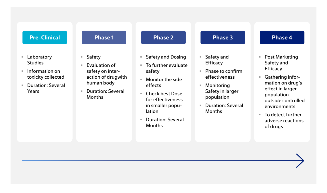
Figure 1: Phases of a Clinical Trial

Clinical trial is a research study to develop new tests and treatments with the aim of gauging its effects on human health.<sup>3</sup> The outcome of the medical intervention i.e., an investigational product or drug ("New drug") on the human volunteers is evaluated. The product under trial could be a drug, vaccine, medical device, surgical and radiological procedure, behavioural treatment, preventive care, cells and biological products, manufactured to receive marketing approval in the country.<sup>4</sup> A clinical trial is uniquely and thoughtfully curated for each new drug based on the needs of the stakeholders - patients, medical practitioners and the host of the experiment.<sup>5</sup> The trial procedure is reviewed and only when it is approved can the trial begin.<sup>6</sup> Thus, a clinical trial is the systematic study of pharmaceutical products on human subjects (whether patients or non-patient volunteers) in order to discover or verify the clinical, pharmacological (including pharmacodynamics/pharmacokinetics) and adverse effects, with the object of determining their safety and efficacy, prior to marketing the product in India.<sup>7</sup>