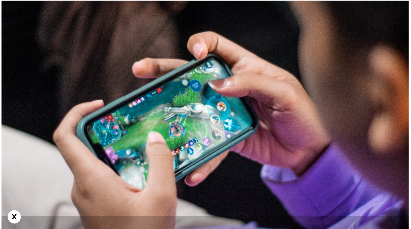
The state governments have viewed the online gaming space as kin of gambling and casinos

Every cloud has a silver lining and from what it seems this stands true for the online gaming industry. The Goods and Service Tax (GST) Council on July 11 announced that a 28% GST will be levied on the full value in the online gaming sector. While the gaming industry has been worried regarding the change in taxation rate, Minister of State for Electronics and Information Technology, Rajeev Chandrasekhar recently said that he will ask the GST council to reconsider its decision. "We were given a mandate in MeitY of what is permissible. Through a series of consultations, we've notified of what is