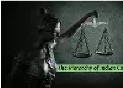
The Hierarchy Of Indian Courts