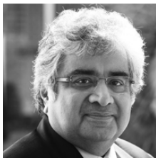
Special Address: Harish Salve